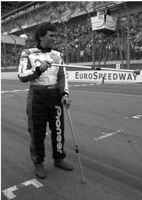
Alex Zanardi returns to the Lausitzring a year and a half later to complete the 13 laps that he missed after his accident.